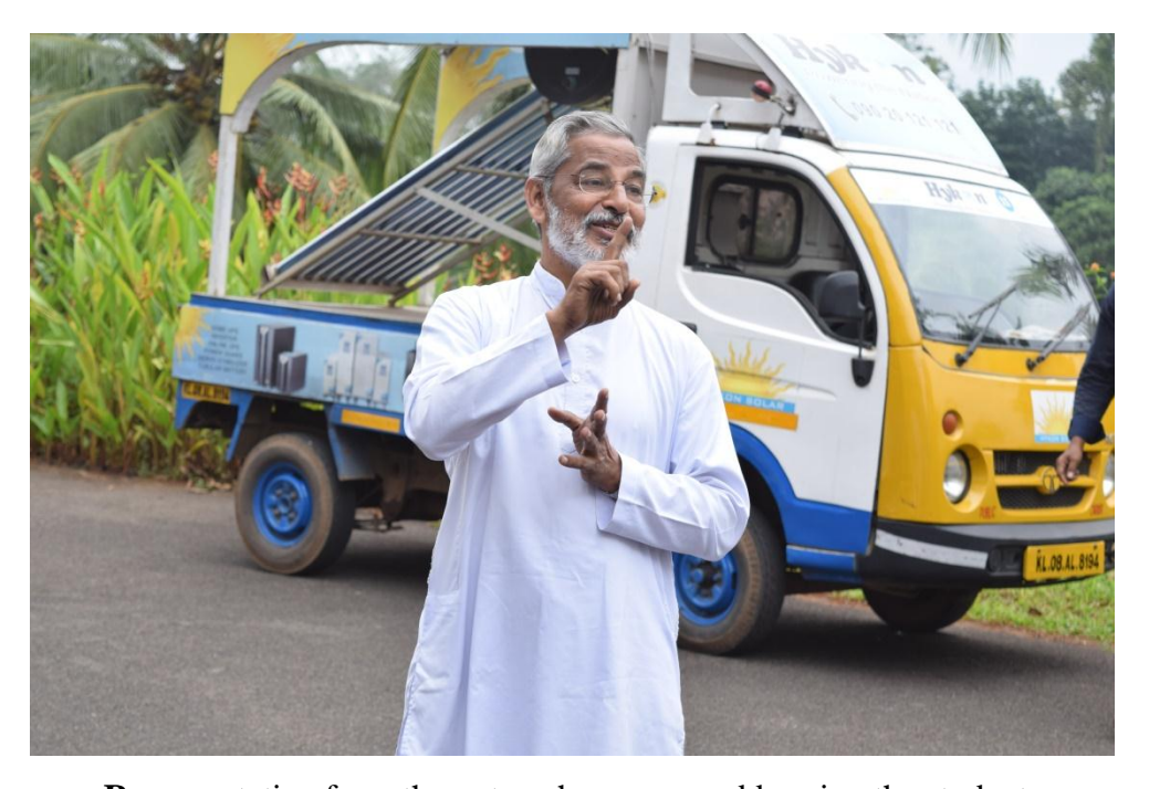
Re presentative from the outreach program addressing the students