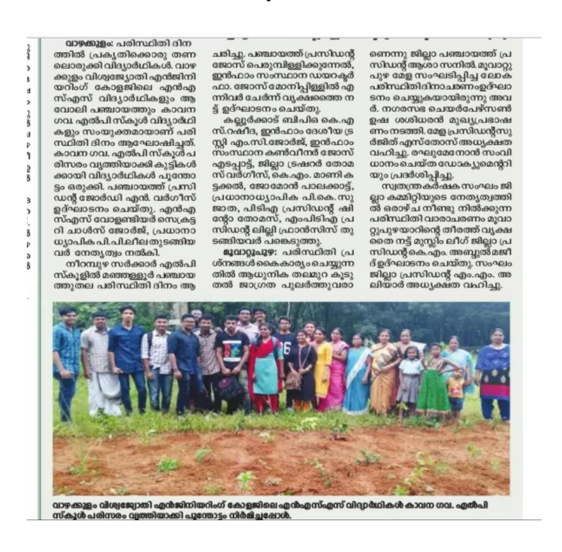
Newspaper Article about the program

• World Environment Day: On 5<sup>th</sup> and 6<sup>th</sup> June 2018, tree saplings were planted at various locations in the Avoly Grama panchyath and at Kavana L P School, in connection with World Environment Day Celebrations.