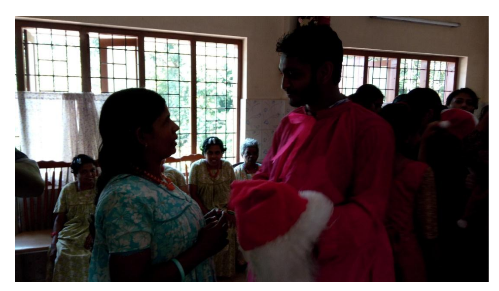
Volunteers at Providence Home in Nadukkara