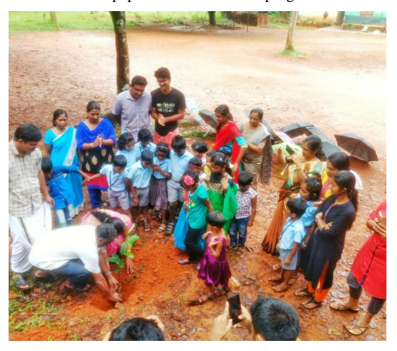
Tree sapling planting at Kavana LP School