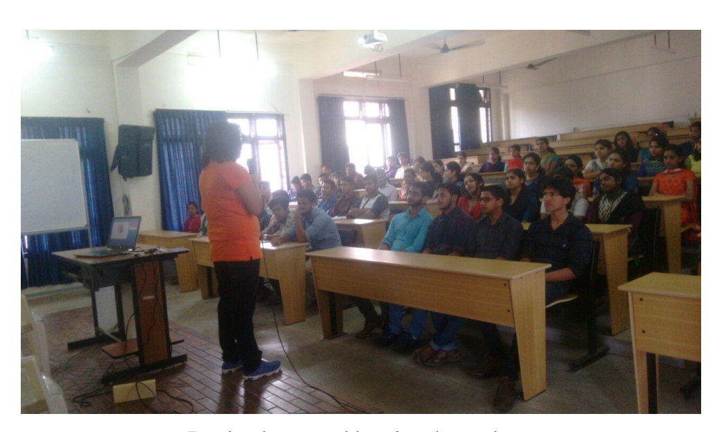
Datri volunteer addressing the students