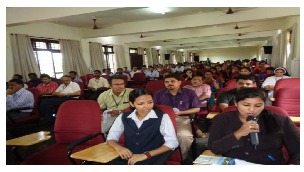
Ongoing session for the teaching faculty