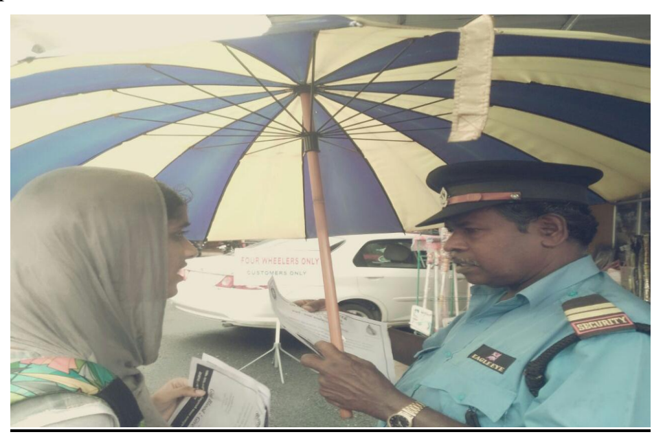
A volunteer giving awareness on blood donation

Blood Donation Awareness: The National Service Scheme unit of VJCET has conducted awareness on 03/07/2017 in the community of Vazhakulam on the importance of blood donation.