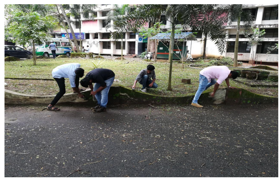
Volunteers at the Clean-Up