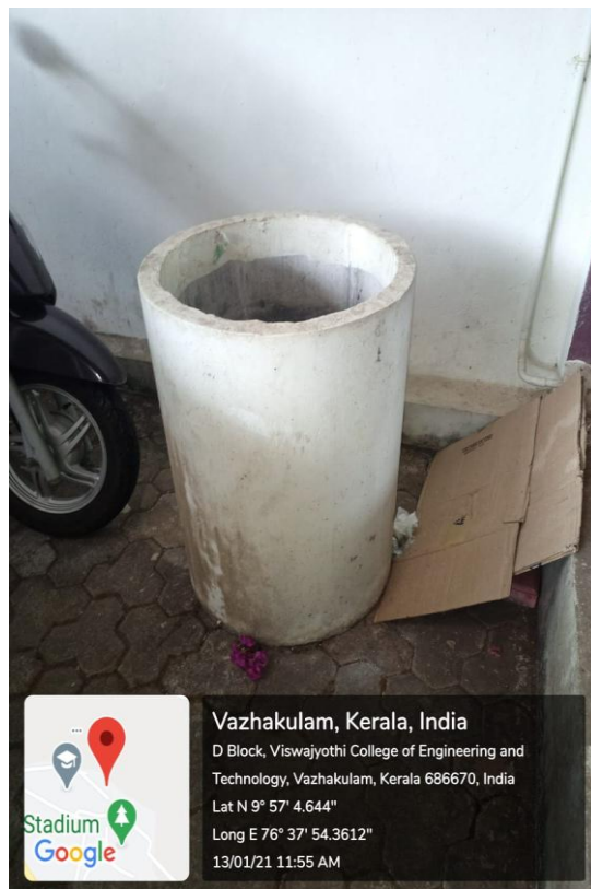
Waste Bin for Broken Glass