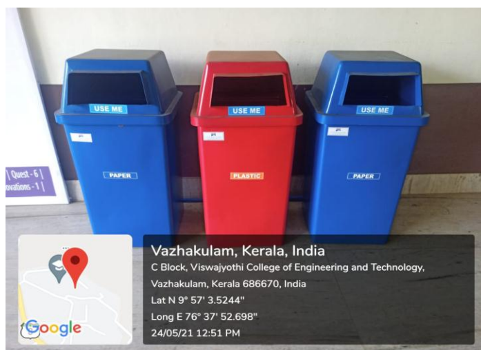
Waste Bin for Paper and Plastic