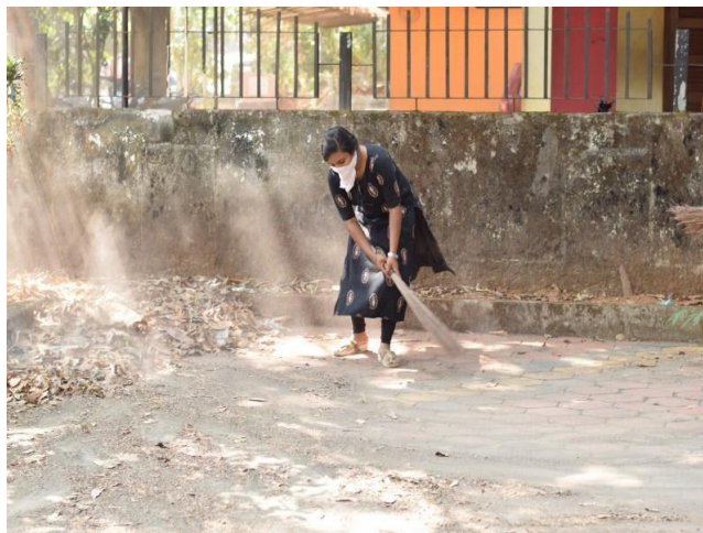
Cleaning of Children's Park

Children's Park was cleaned by the NSS Volunteers on Feb 20 th 2019. Around 20 volunteers had participated.