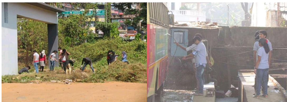
Cleaning of KSRTC Bus Stand

The KSRTC Bus depot at Muvattupuzha and its surroundings were cleaned by the NSS Volunteers on Feb 26 th . The Program was inaugurated by the Municipality Councilor.