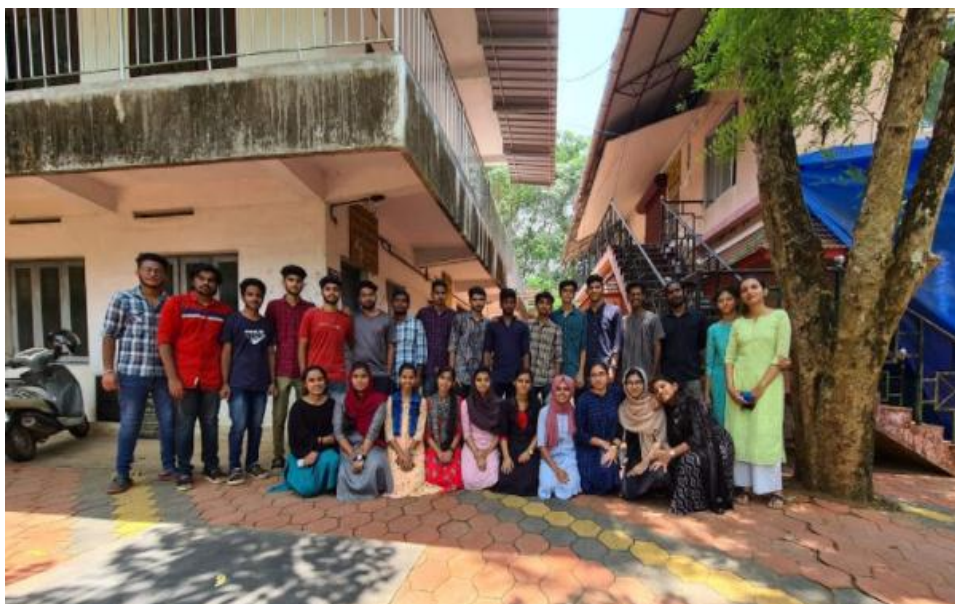
Cleaning activities by the NSS volunteers at AvoliPanchayat