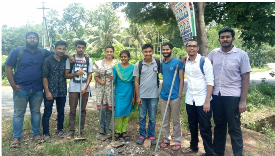
Cleaning of premises of Kavana L P School

On 7 th May 2018, the surroundings of Kavana L P School were cleaned by the NSS volunteers in connection with Swachh Bharat Abhiyan