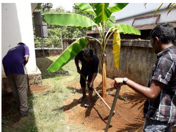
Cleaning of Homeo Clinic in AvolyPanchayat

The Homeo Clinic in AvolyPanchayat and its surroundings were cleaned by the nss volunteers on Feb 25 th .