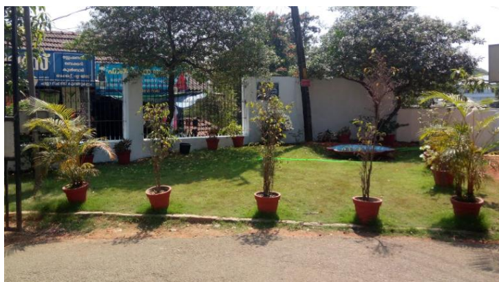
Revamping of machineries and cleaning