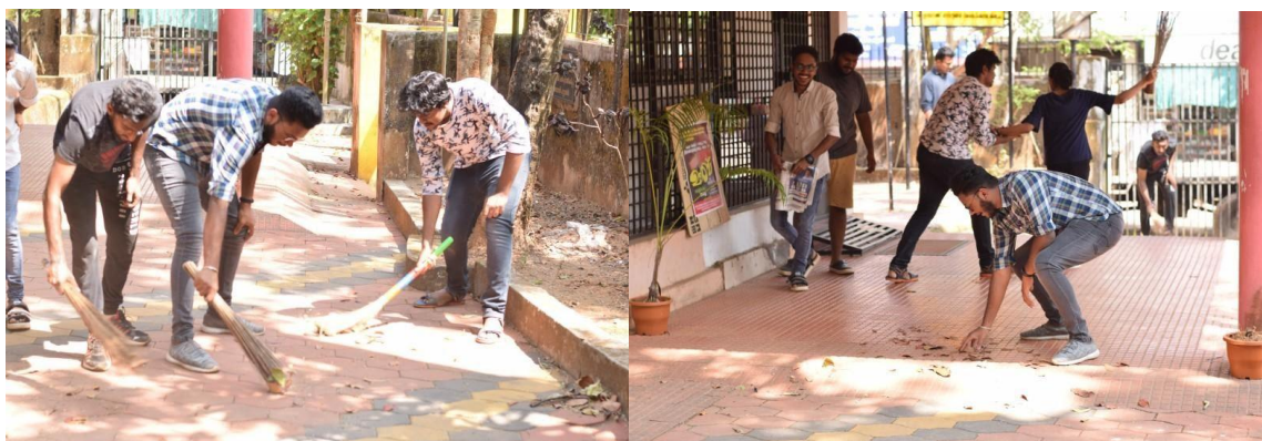
Cleaning of Panchayat Office

Avoly Panchayat Office and its surroundings were cleaned by the NSS volunteers on Feb 23 rd . The program was inaugurated by the Panchayat Member.