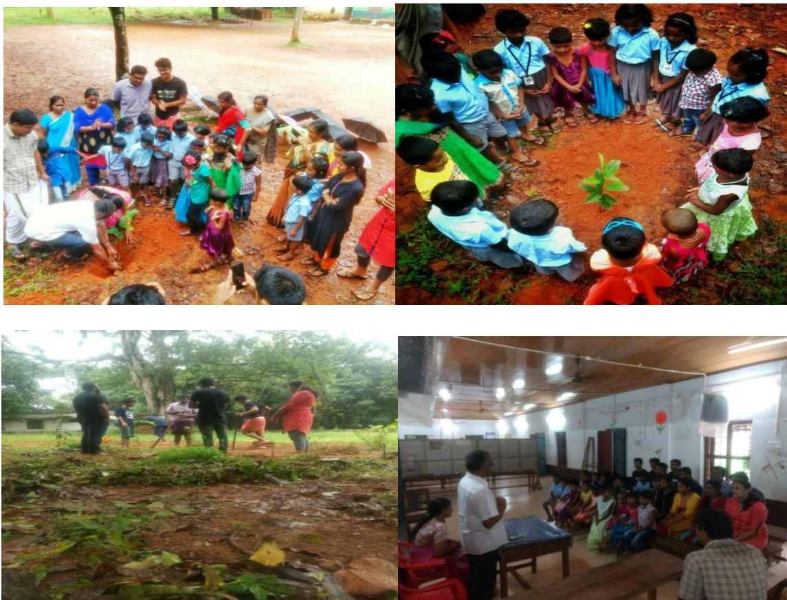
Planting of tree sapling and cleaning at Govt L P School, Kavana