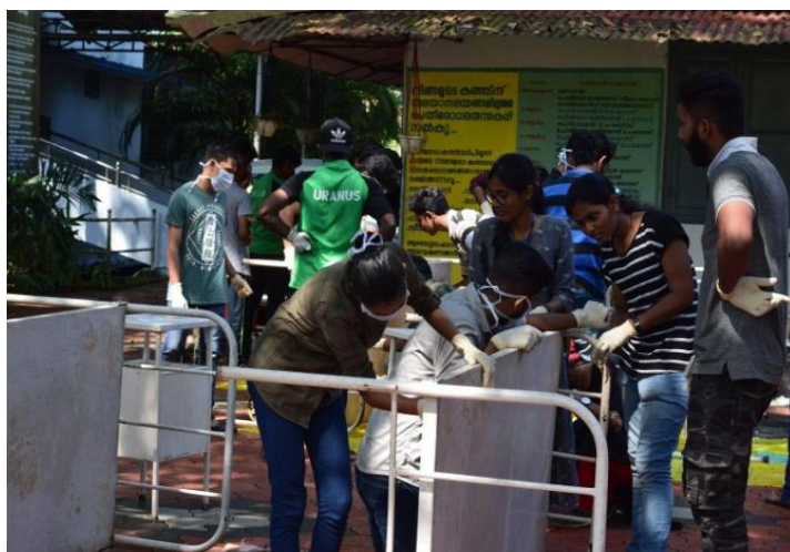
Revamping of health centre equipments