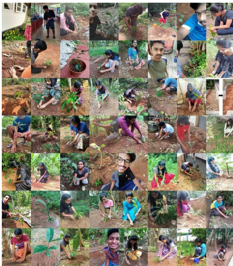
Tree sapling planting

The National Service Scheme unit of VJCET, Vazhakulam had organized a Tree Plantation program on 1st November 2020 as a part of Kerala Piravi. The program was conducted in online mode and around 100 volunteers actively participated by planting saplings at their home.