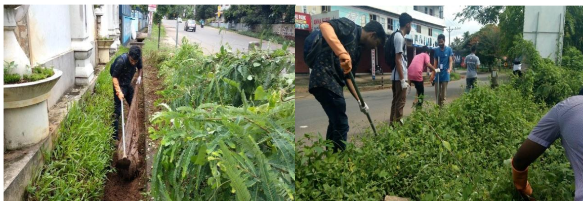
Cleaning of the drainage,Avoly.