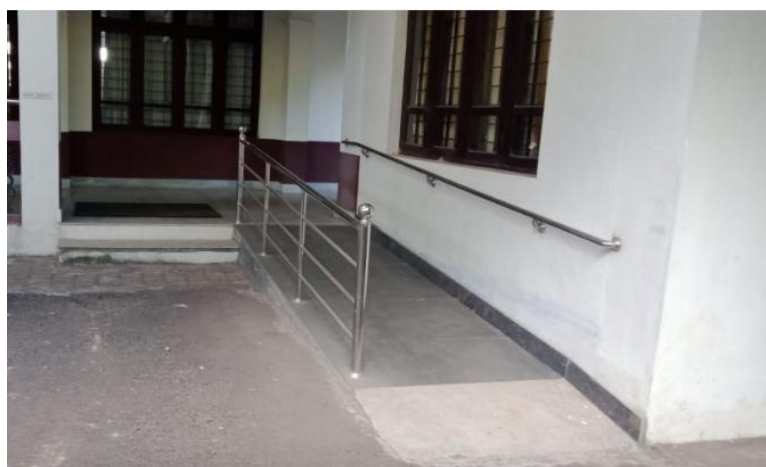
Ramp in the D-Block

Ramps are available in the D block. The gradient of ramps is suitable for easy use by wheelchair users. Ramps are wide enough for use by wheelchair users. Ramp surfaces are slip resistant and clear of obstacles. They are protected on both sides. Ramps are marked with the international symbol of accessibility.