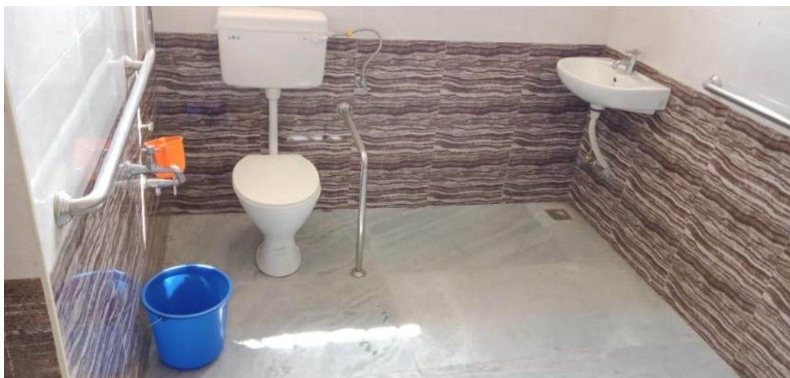
Special Washrooms for disabled

Separate toilets are available for people with disabilities. They are clearly identifiable and accessible. The doors are wide enough and there is enough maneuvering space inside toilets. All floor surfaces should be slip resistant. Flushing arrangements, dispensers etc. are mounted at appropriate heights.