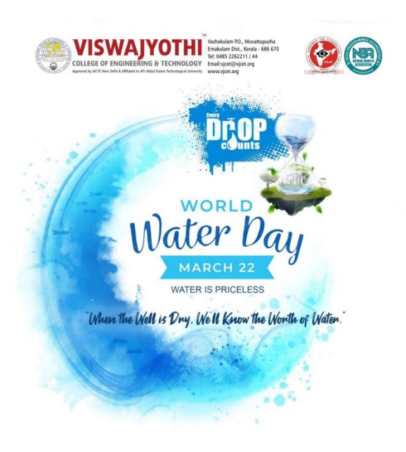
Fig:-World Water Day Poster made by Science Humanities Department

• WORLD WATER DAY - World Water Day was celebrated organized by Science & Humanities Dept. for 2023 by the session of poster making contest and Poster made by Science Humanities Department won the contest.