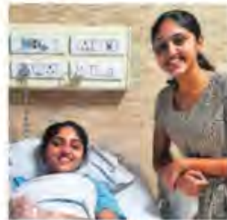
മിന്നാമിന്നിപ്പോലെ, മിന്നാമിന്നിപ്പോലെ, സാധാരണക്കാരനായി എഴുന്നേൽക്കുന്ന ഒരു കുഞ്ഞിനെപ്പോലെ...