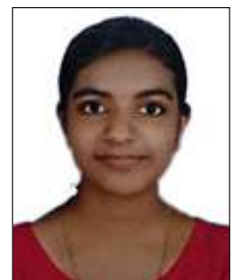
ANU BABY Acabes