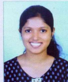
NINU JOB S7 IT